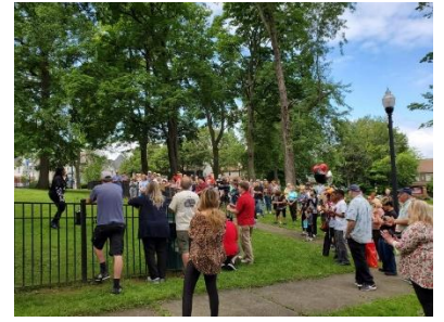
Image of Jamestown Rally from WRFA.

Source: https://www.thedailynewsonline.com/top_story/https-breeding-program-will-develop-signature-nv-varieties/article_63881a25-f6d2-5a42-9d86-7b7917c72133.html?utm_medium=social&utm_source=facebook&utm_campaign=user-share&fbclid=IwAR1LWumg8E7Sc7z793YSpSeSEIEYaeUXSnBDU4sZwm3h3DEEX-VbF0